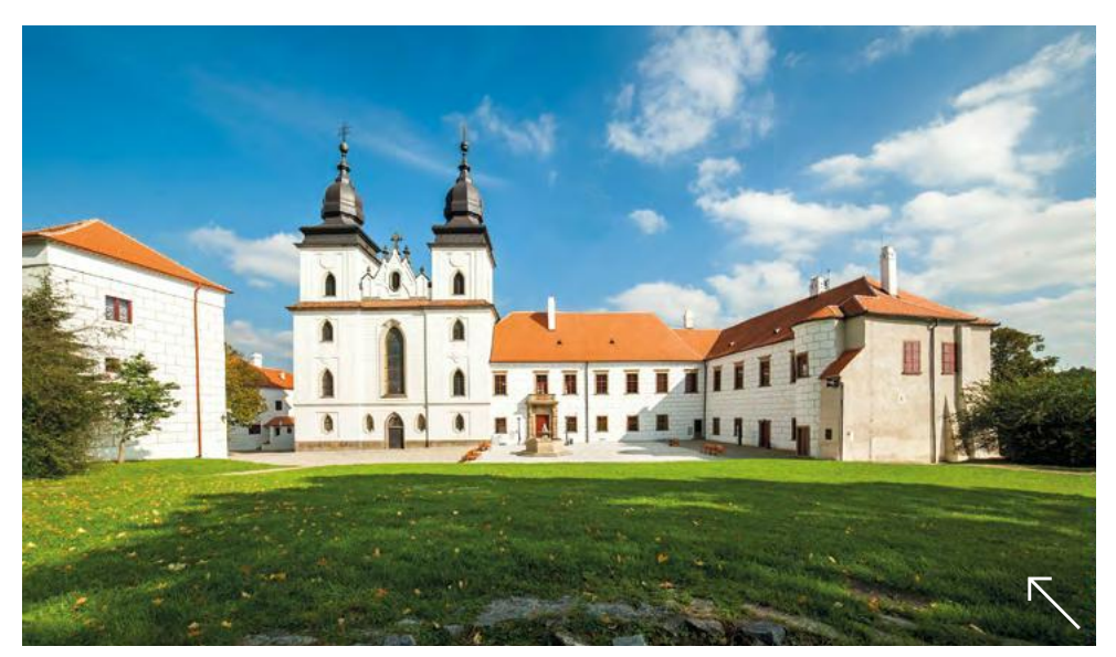
Vysočina Museum Třebíč