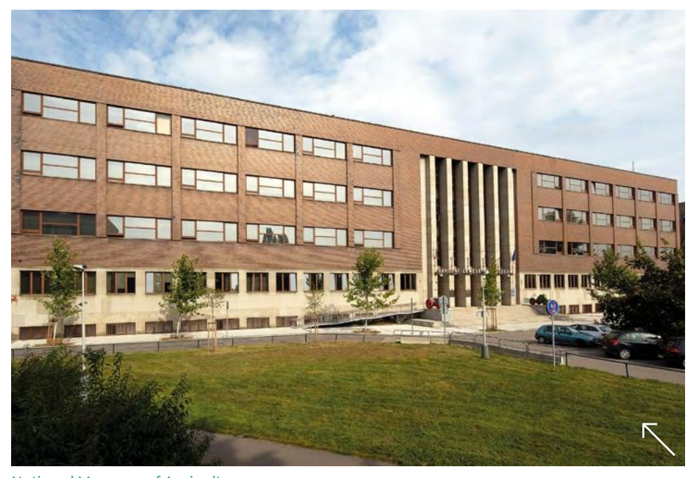
National Museum of Agriculture