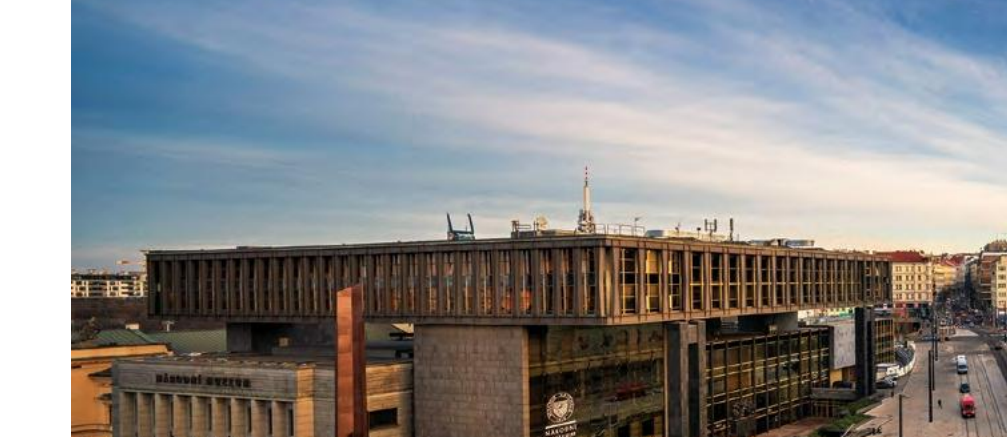
Museum Complex of the National Museum