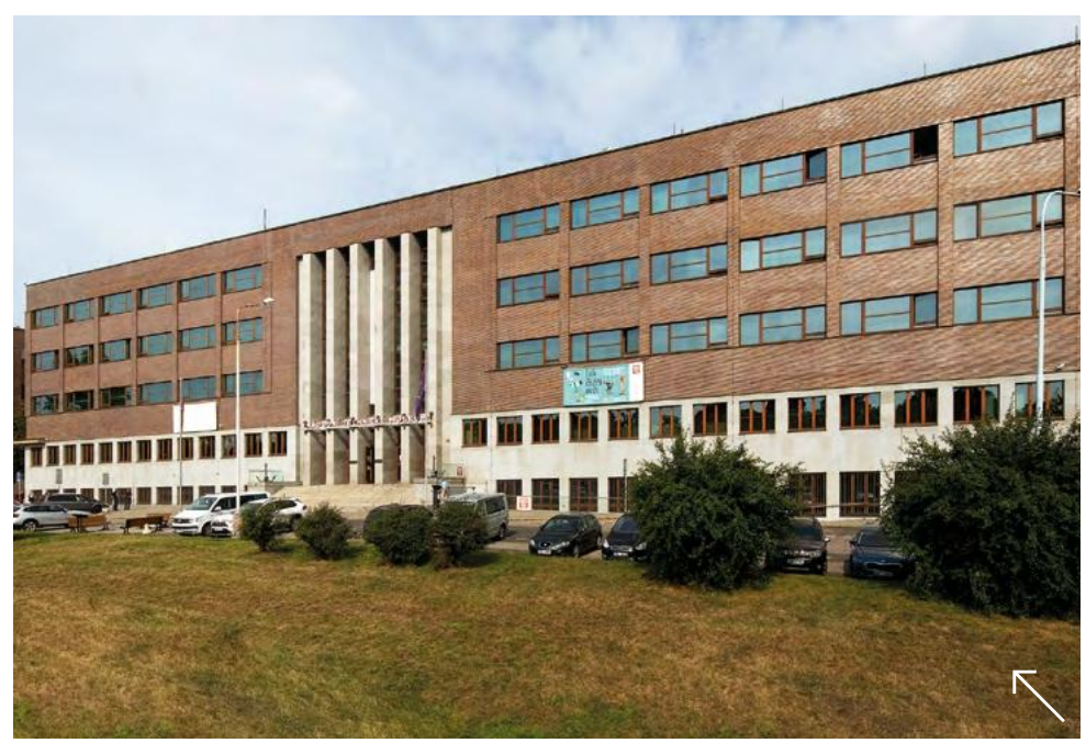
National Technical Museum