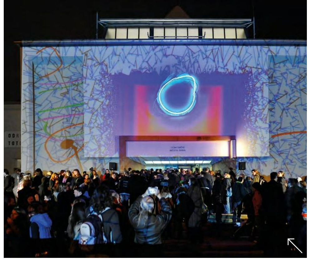
House of Arts Brno

Purpose → Museums and the civil society Sustainability → Museums and resilience Vision → Museums and leadership Delivery → Museums and new technologies