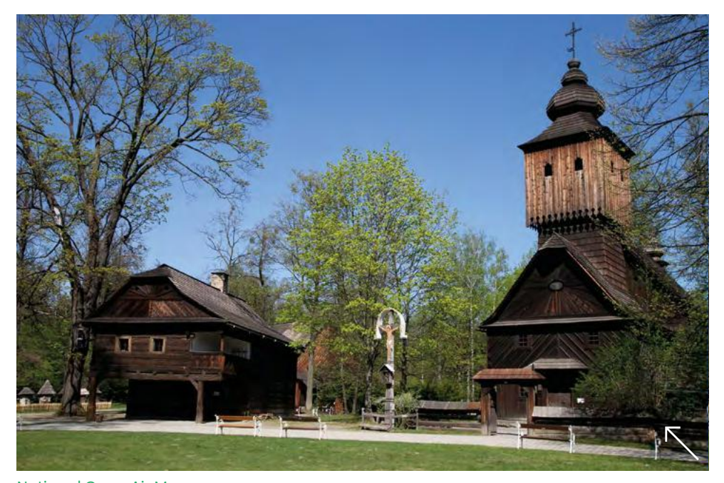
National Open Air Museum