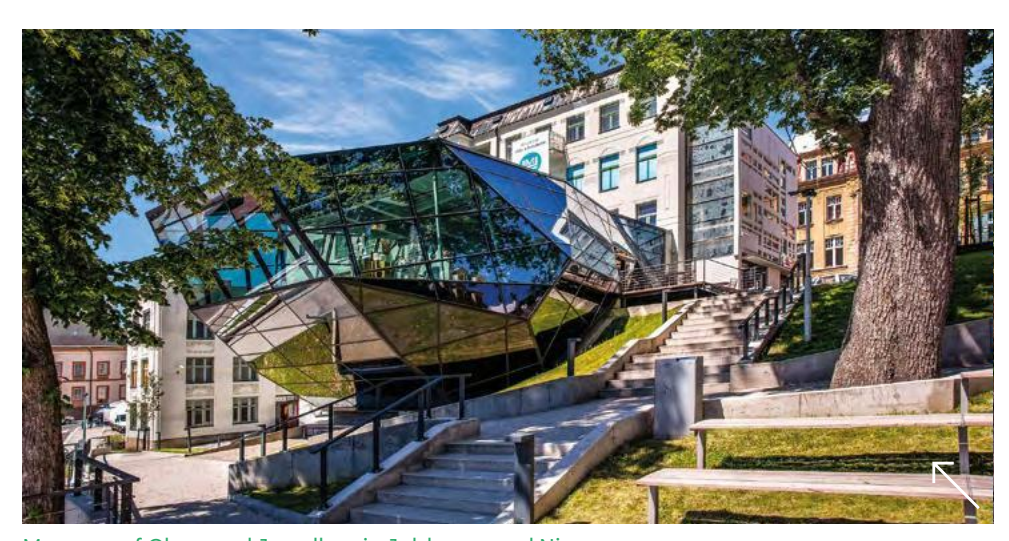
Museum of Glass and Jewellery in Jablonec nad Nisou