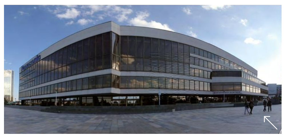
Prague Congress Centre

Conference participants will pay a registration fee of a basic amount of 350 EUR for onsite and 150 EUR for remote attendance.